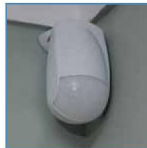
PIR (Movement Detector)