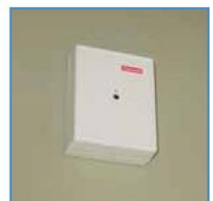
Temperature Extremes Sensor