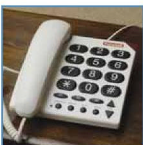
Big Button Telephone